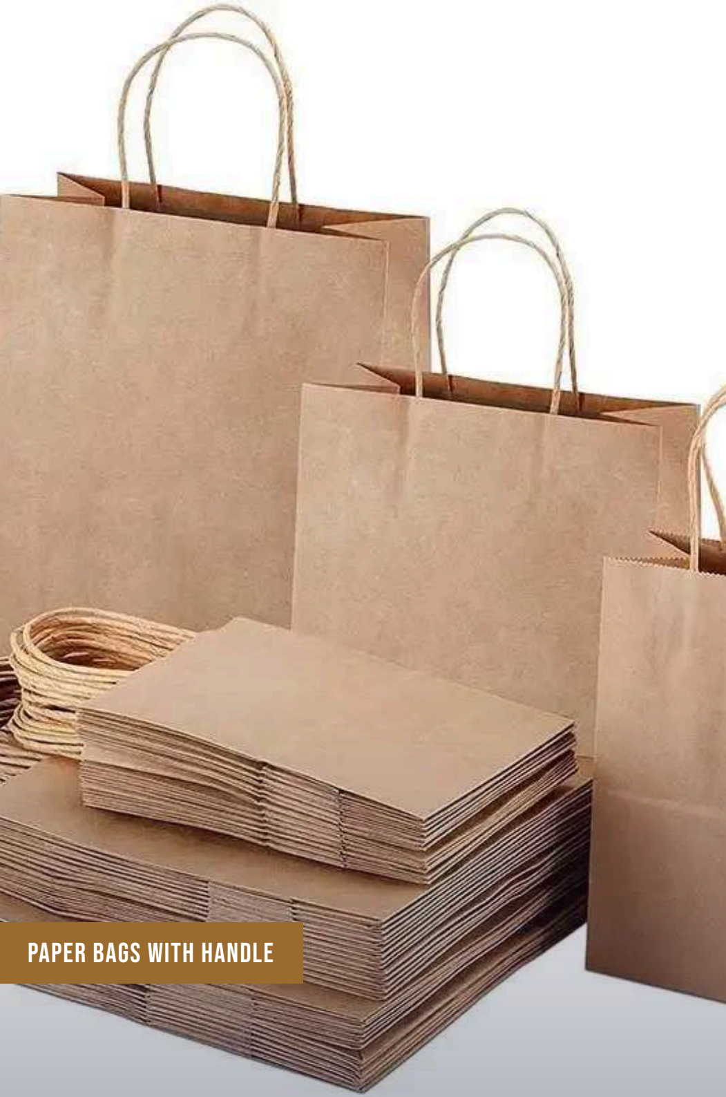
PAPER BAGS WITH HANDLE