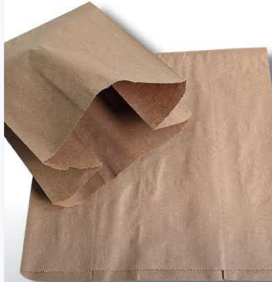
PAPER TRASH BAGS