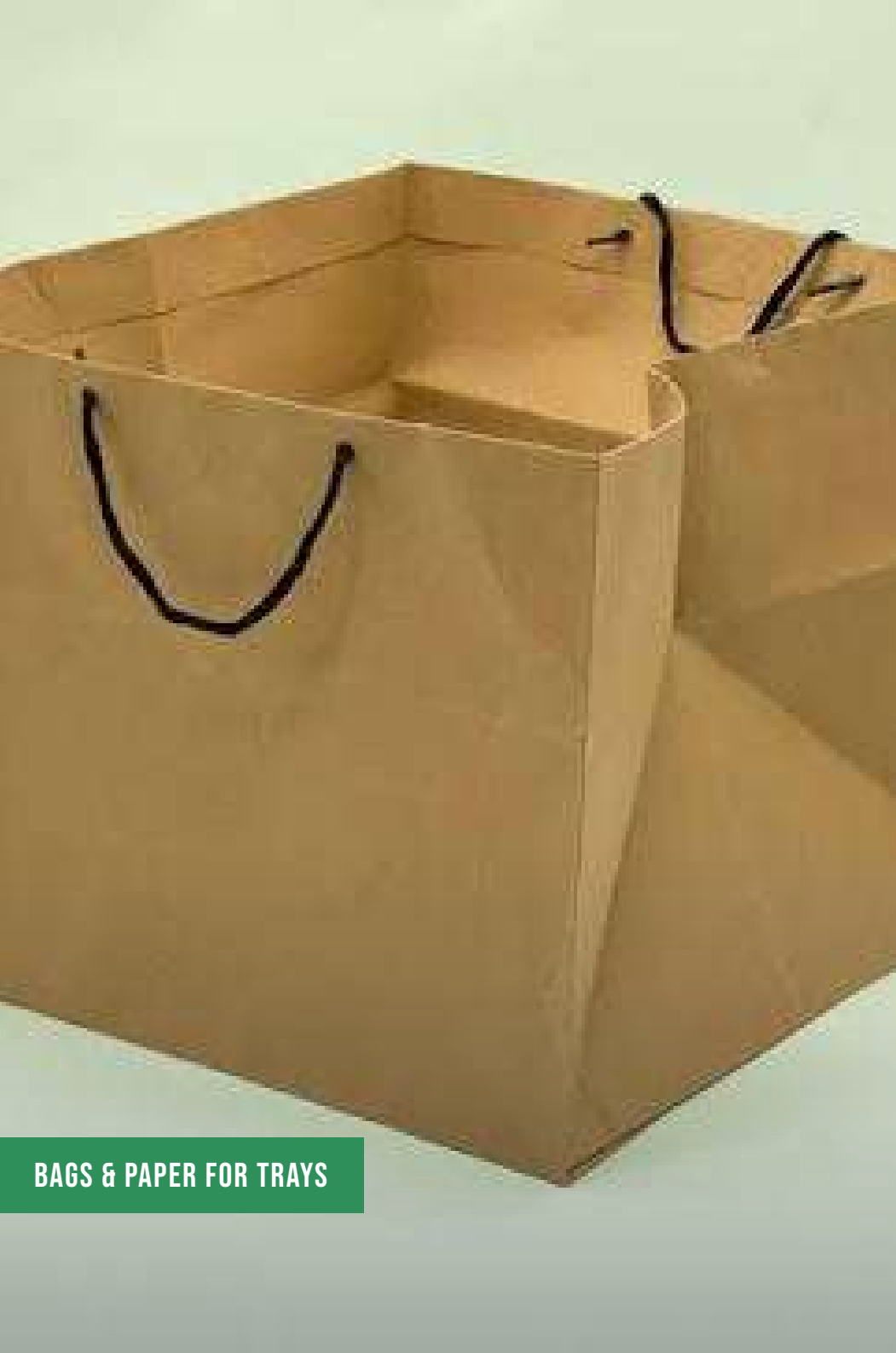
BAGS & PAPER FOR TRAYS