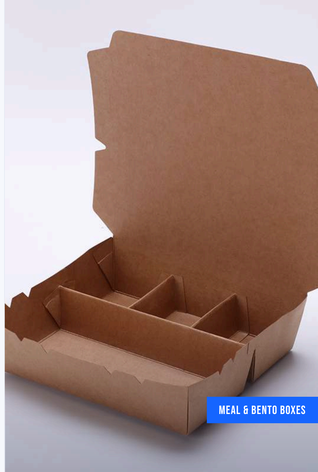
MEAL & BENTO BOXES