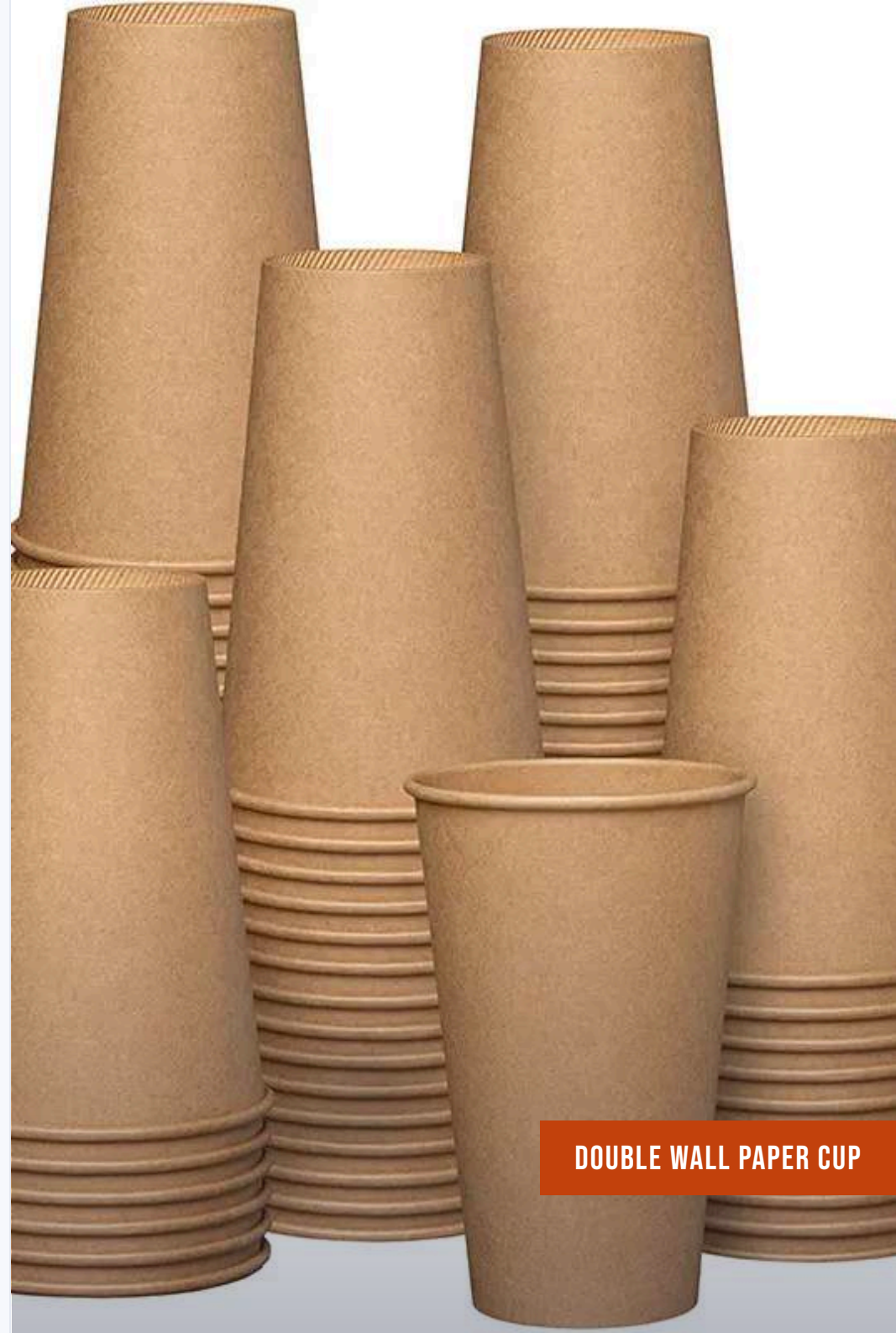
DOUBLE WALL PAPER CUP