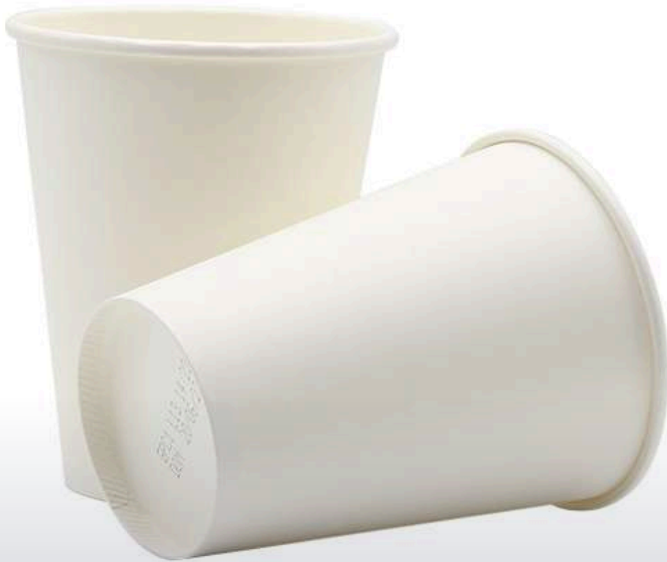
SINGLE WALL PAPER CUP