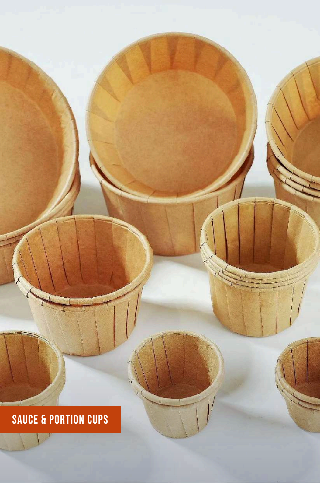
SAUCE & PORTION CUPS