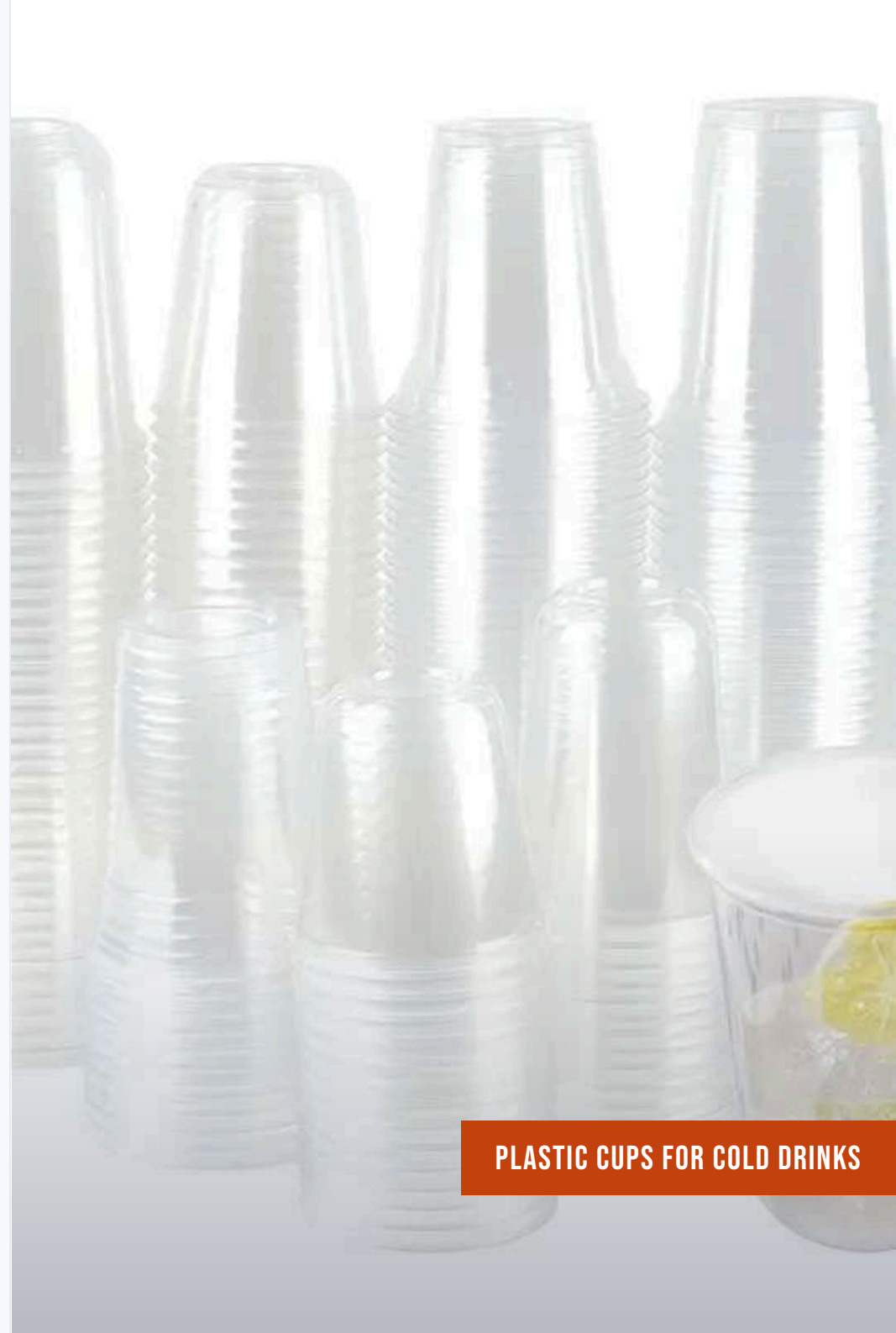
PLASTIC CUPS FOR COLD DRINKS