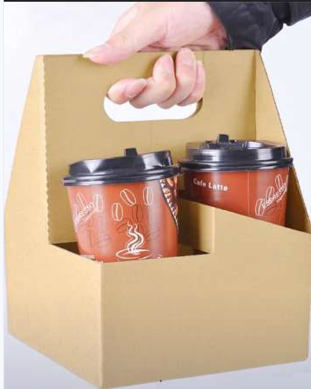
CUP CARRIERS / HOLDERS