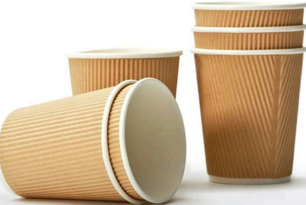
RIPPLE WALL PAPER CUP