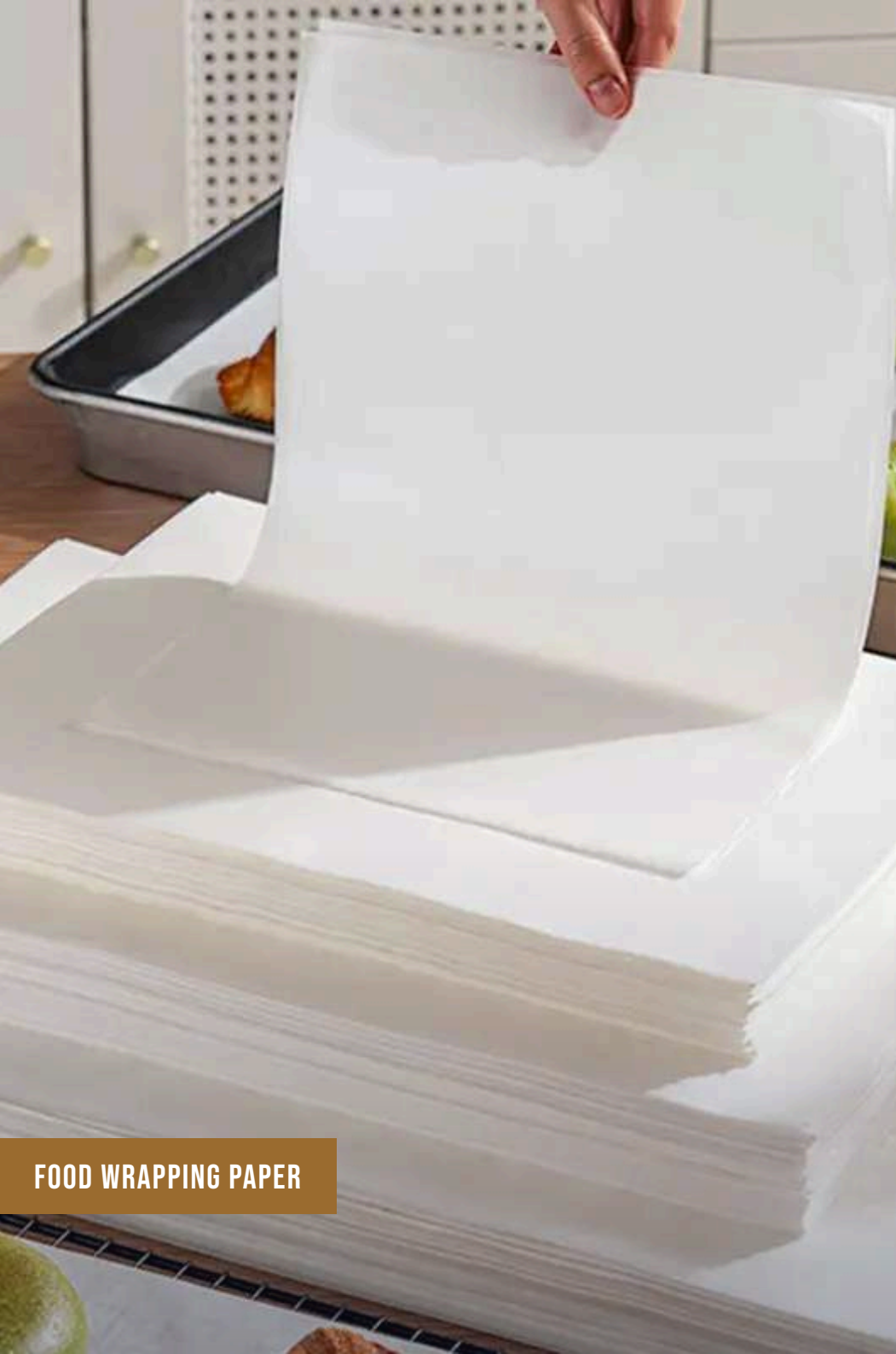
FOOD WRAPPING PAPER