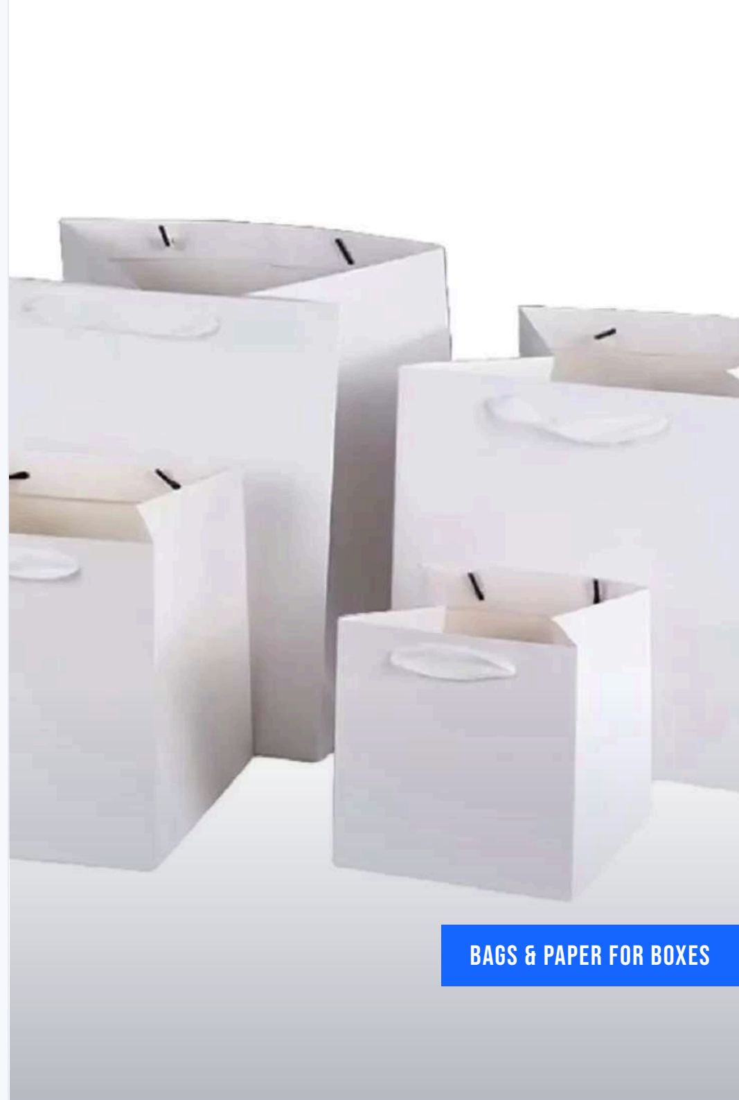
BAGS & PAPER FOR BOXES